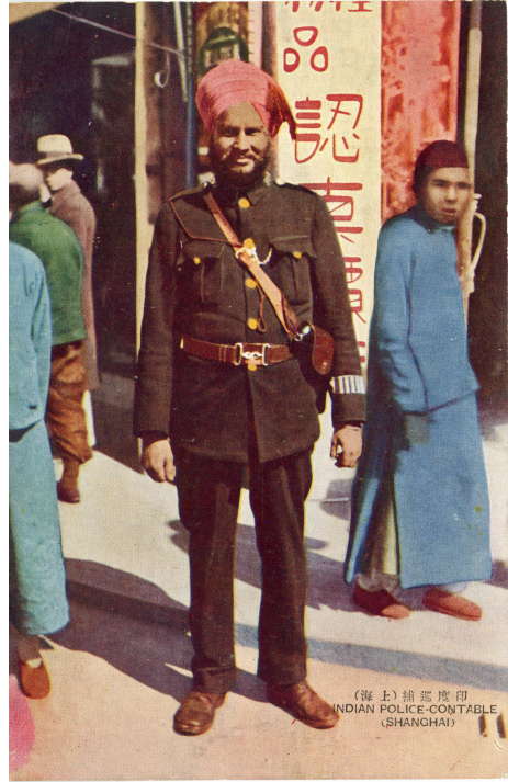
(海上) 巡捕房 INDIAN POLICE-CONSTABLE (SHANGHAI)