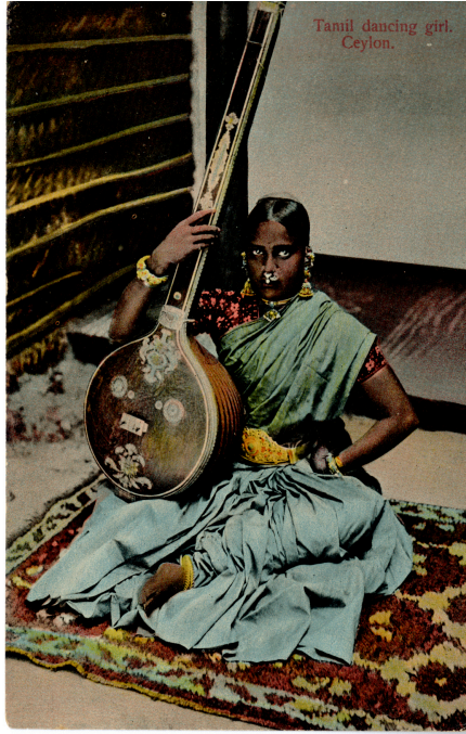
Tamil dancing girl. Ceylon.